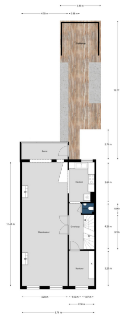
Alphenstraat 60, Den Haag | 1e Verdieping H = 3,13 m