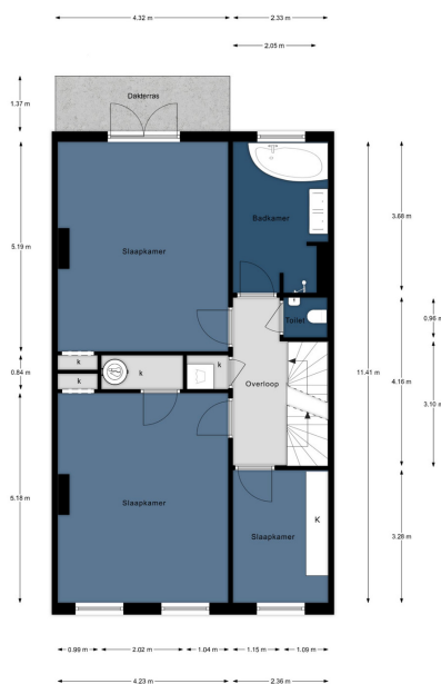
Alphenstraat 60, Den Haag | 2e Verdieping H = 2,98 m