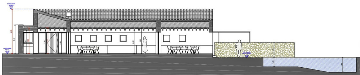
SECCIÓN 1 E: 1/50