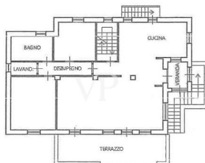
PIANO PRIMO H. = mt. 2,90