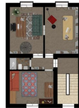
PIANTA PIANO SECONDO