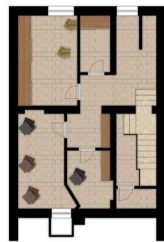
PIANTA PIANO SEMINTERRATO