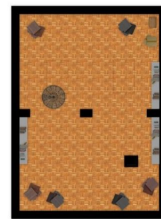
PIANTA PIANO SOTTOTETTO

This floor plan is not to scale. The documents were given to us by the client. For this reason, we cannot guarantee the accuracy of the information.