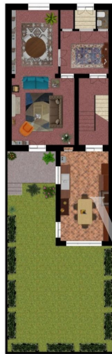
PIANTA PIANO TERRA