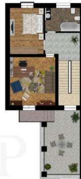
PIANTA PIANO PRIMO