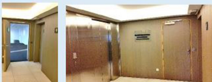
Level +4 Entrance